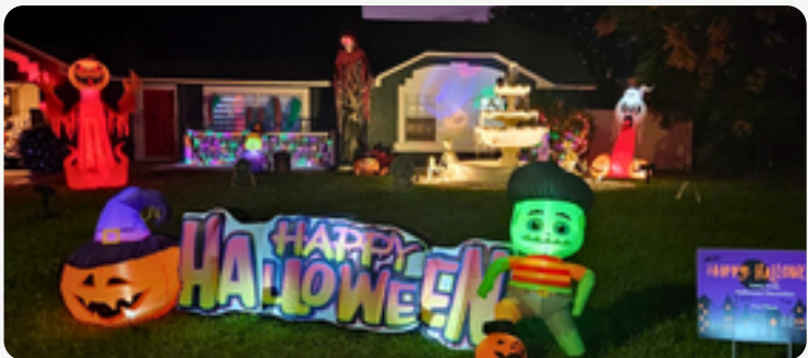
Congratulations 199 Ronda Court! See all the photos online at www.lomalindahoa.com